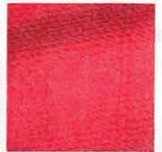
EV-tec™ textured knit